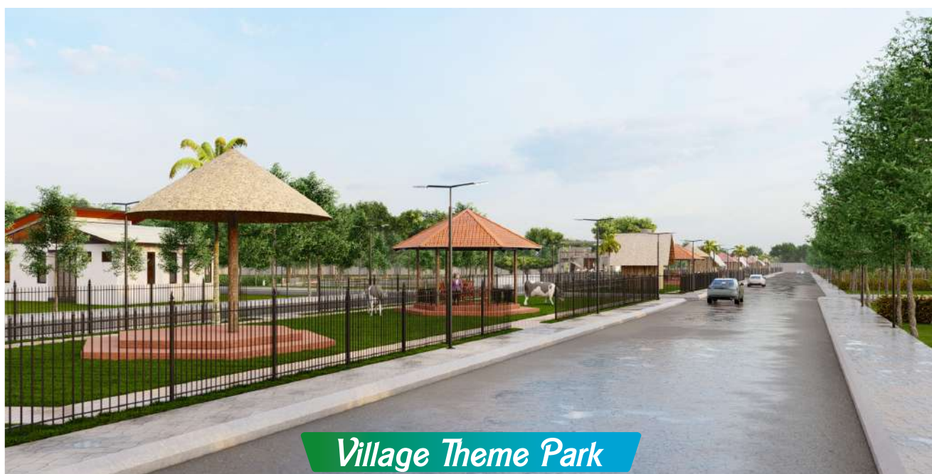
Village Theme Park