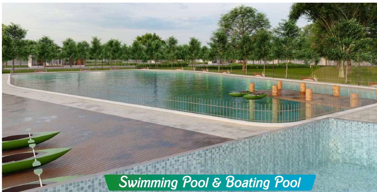
Swimming Pool & Boating Pool