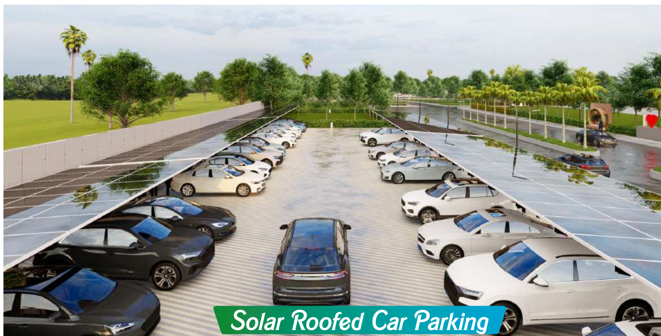
Solar Roofed Car Parking